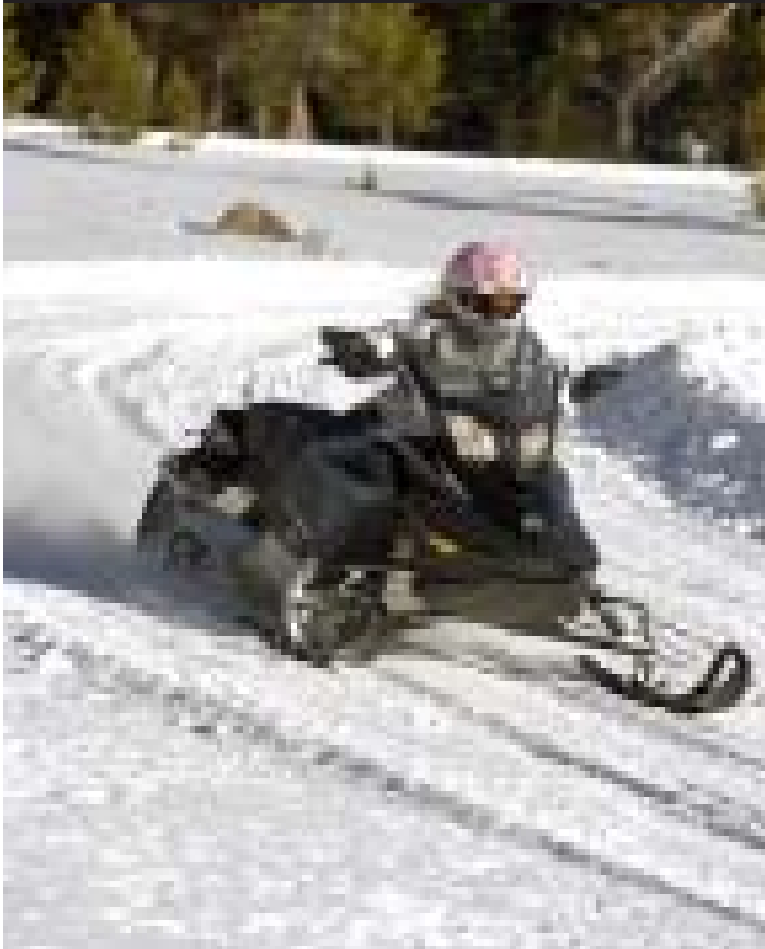
Time to check out that new sled?