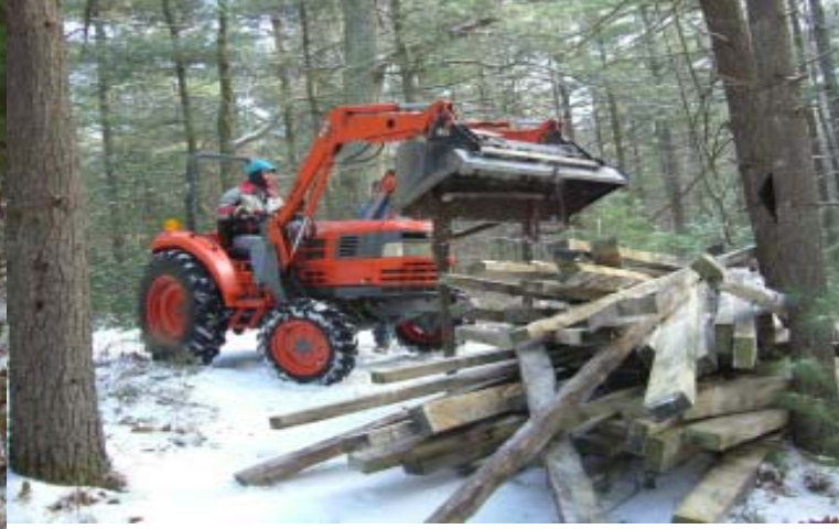
Pictures above are from the project to rebuild a major bridge between Belchertown and Shutesbury. Members of both the Porcupine Ridge Runners and the Mill Valley Snowmobile club worked hard to complete this project just in time for the BIG snowstorm.