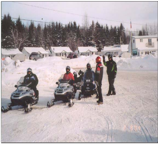
In downtown Pittsburgh, N.H. Club members getting ready for day's ride.