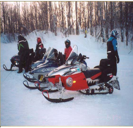
Another stop along the trail for the MillValley Club members in Pittsburgh, N.H.