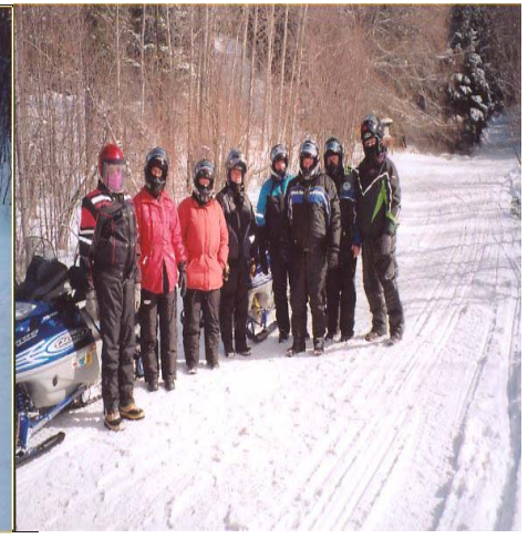
What a beautifully groomed trail. More fun on the Mill Valley Club trip.