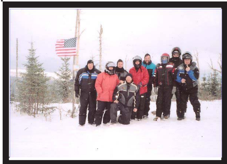
Mill Valley Club members enjoying a stop along the trail in Pittsborough, N.H. For more photos of club trip please see page 2.