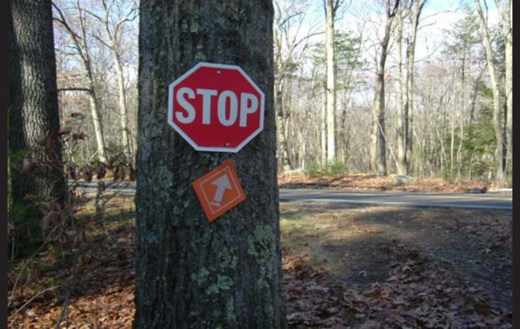
“STOP” & take time to put up some trail signs